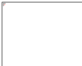
Hotel Tashi Yoedling Thimphu, Thimphu, Bhutan

We offer the best 3* hotels in Bhutan however hotels are subject to availability on the time of booking.