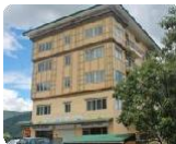
Hotel Bhutan Home Deki Lam, Thimphu, Thimphu, Bhutan